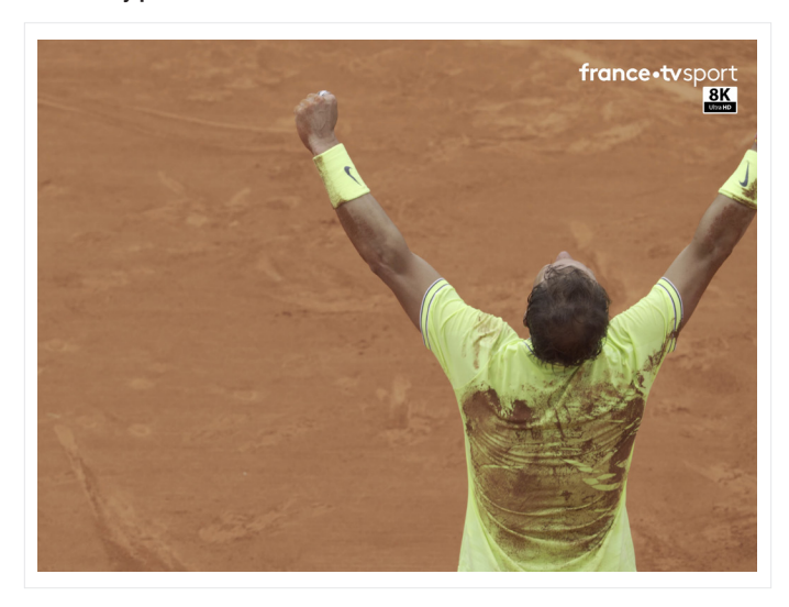
Figure 1. Scene from 8K TV streaming at the 2019 French Open tennis tournament.<sup>3</sup>